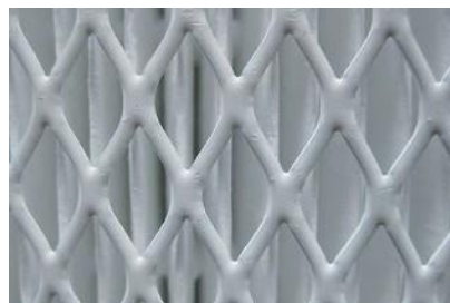
Detail of ULPA 15 Filter Cartridge - protected with grid for protection of filter medium