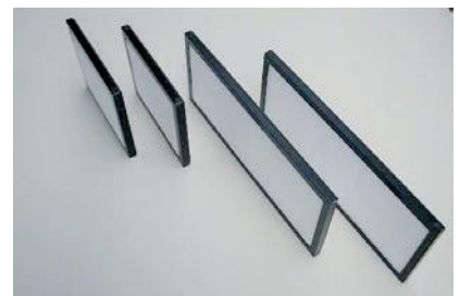
Additional pré-filtration on the outside of the device