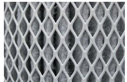
Detail of the MedicCleanAir Pro H14 filter cartridge with grid to protect the filter medium. Picture taken of front side F9 + activated carbon (= what gives the black colour)