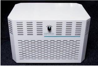
Standard Pro 110 Device in epoxy white, anti bacterial coating