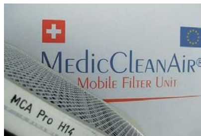
MedicCleanAir Pro H14 Filter Cartridge consists of Pre-filter F9 + activated carbon + Hepa14 level