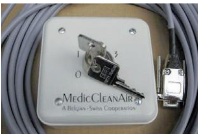
Remote Control Device by key (only operation possible by hospital staff)