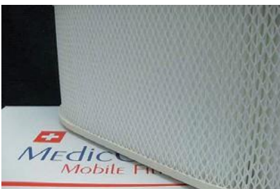
Ulpa 15 Filter Cartridge