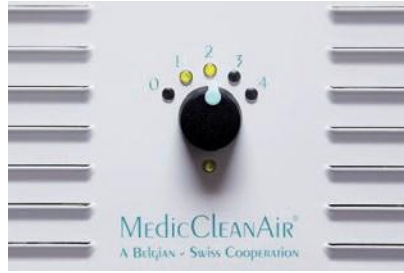
Detail of the standard controls 0 - 1 - 2 - 3 - 4 levels of purification, LED's and filter check LED (green-yellow and red colour)