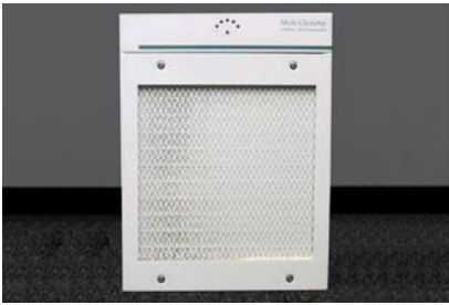
Standard ISO 210 Device for wall assembly - front view with filter unit (ULPA 15 level) and LED display (0-1-2-3-automatic + filter check)