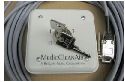
Standard Remote Control operated by key with positions 0 - 1 - 2 - 3 - 4