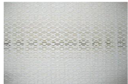
Filter detail of the ULPA 15 filter cartridge