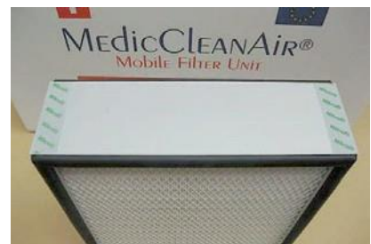
Filter cartridge ULPA 15