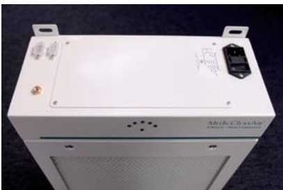
Detail of the filter unit with clear view of the pressure difference sensor, RC-connection, PC-connection and electricity plug, operational LED's + filter check