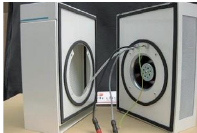
ISO 200 Device window assembly with clear view of both rear sides of the filter- & ventilator unit with cable connections, pressure difference tube, joints, assembly bolts