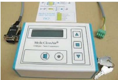
Remote Control by key with permanent pressure difference display, cable with connection plugs, short instruction manual for hospital staff (head nurses, technical department, etc.)