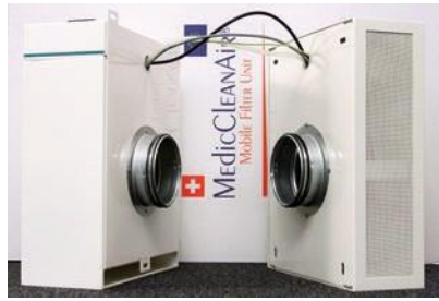
Filter- & ventilator unit - rear view with tube connections & cables connections