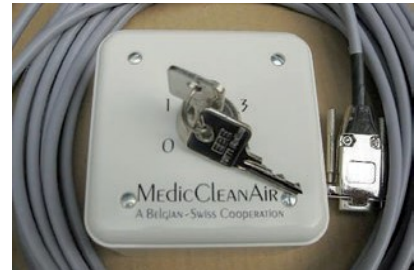
Standard Remote Control operated by key with positions 0 - 1 - 2 - 3 - 4