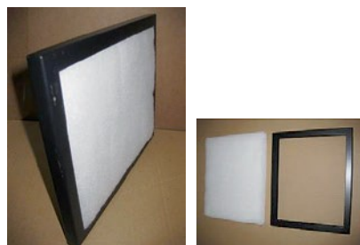
Additional pre-filtration on the outside of filter unit