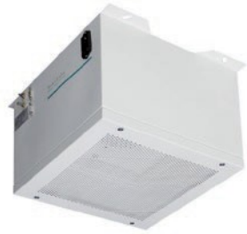
Standard ISO 100 Device for wall or ceiling assembly - main view with filter unit and cables connections