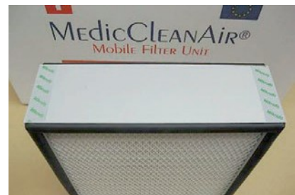
Filter cartridge ULPA 15