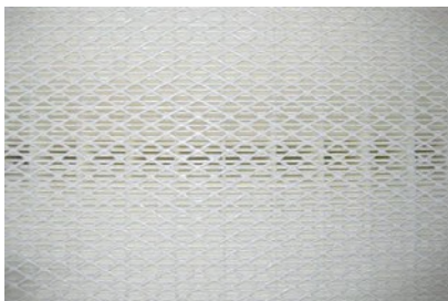
Filter detail of the ULPA 15 filter cartridge