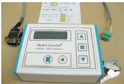
Remote Control by key with permanent pressure difference display, cable with connection plugs, short instruction manual for hospital staff (head nurses, technical department, etc.)