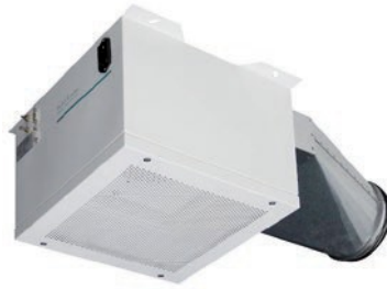
Standard ISO 120 Device for wall or ceiling assembly - main view with filter unit, cables connections and special tube connection